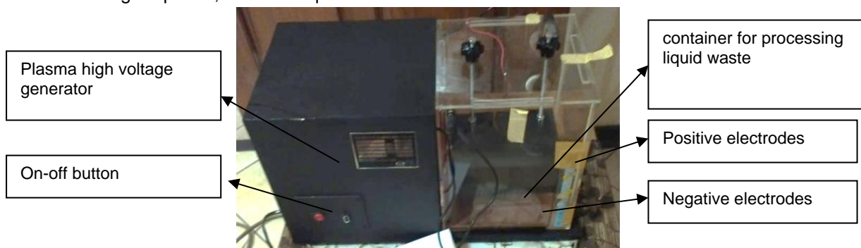
Figure 1. Scheme of Plasma Reactor